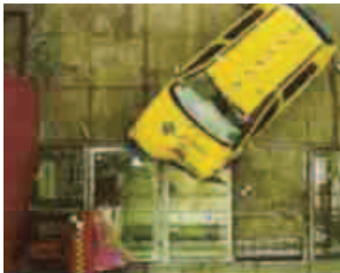
Fig. 6. Frontal impact against OBD – TNO