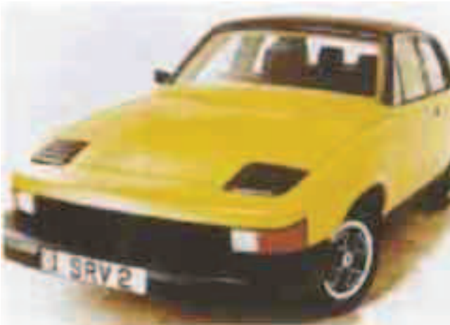
Fig. 1. The early version of Experimental Safety Vehicle – TRL