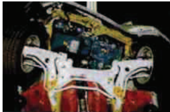
Fig. 7. Vehicle underbody after frontal impact against OBD – BASf