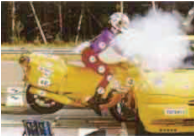
Fig. 3. Motorcycle equipped with airbag and leg protectors crash test – IMMA