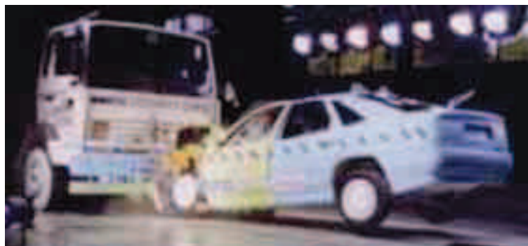
Fig. 5. Front under run crash test – INRETS