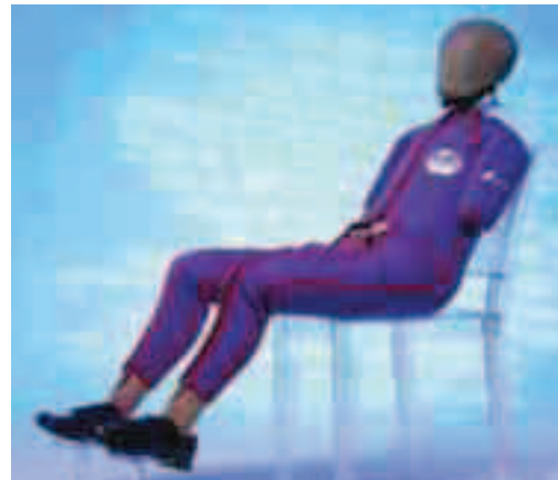
Fig. 4. Test dummy WorldSID – the 5 percentile woman – INRETS