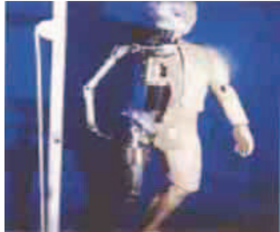
Fig. 2. The early anthropometric research dummy – INRETS