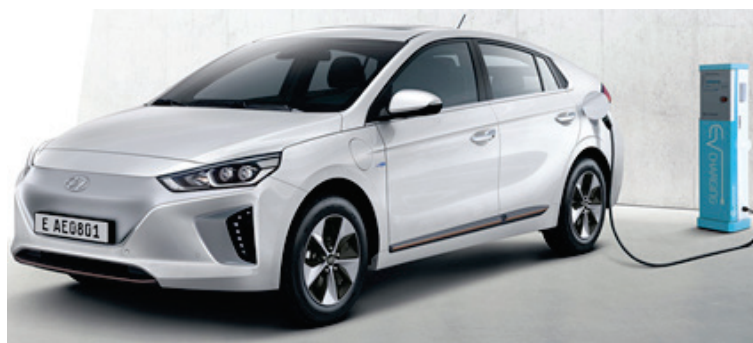
Fig. 1. An electric car – Hyundai IONIQ [8]

In the presented analyses of toxic compounds emissions, three models of electric cars were considered, to which further stages of work were devoted. These are Hyundai IONIQ ELECTRIC, Nissan LEAF, Tesla Model S.