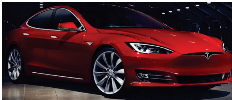
Fig. 3 Tesla Model S electric car [11]

Hyundai IONIQ ELECTRIC is a sedan car, with front-wheel drive, five-person, five-door, compact class. Nissan LEAF is a hatchback car, with front-wheel drive, five-person, five-door, compact class and The Tesla Model S is a lift back passenger car with rear-wheel drive, five-person, five-door, premium class.