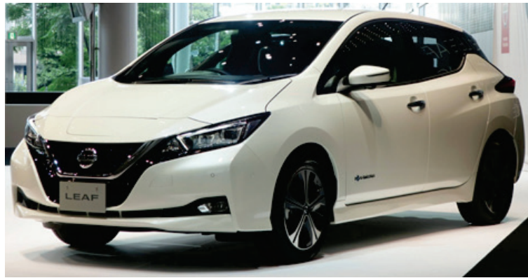
Fig. 2 Nissan LEAF electric car [9]