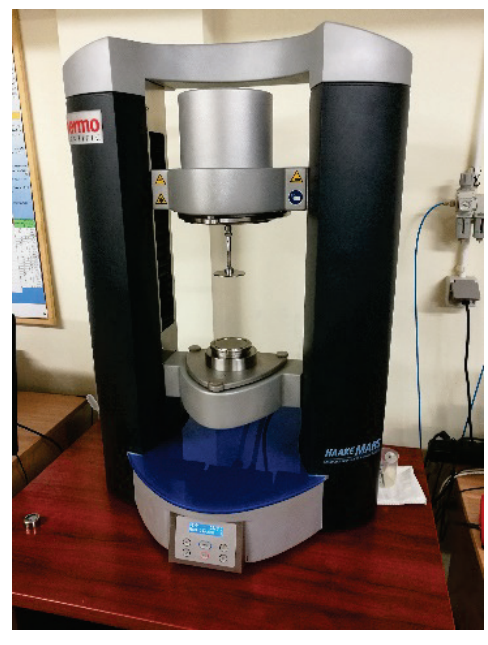
Fig. 6. HAAKE MARS rotational rheometer

Analysis of both types of fuels shows that the calorific value of both fuels is comparable and similar to the properties of petroleum products, e.g. petrol. However, due to the low viscosity coefficient, it is recommended to utilize obtained fuel only for process maintenance or heating purposes, but not for propulsion purposes, e.g. for powering piston engines.