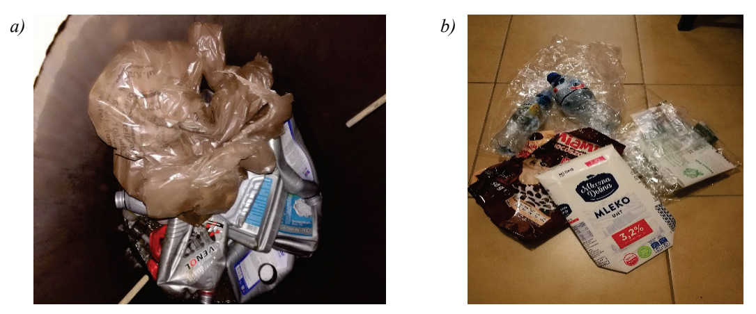
Fig. 1. Batch: a) PE group plastics, b) mixed waste

Photos of the waste utilized in the process are shown in Fig. 1.