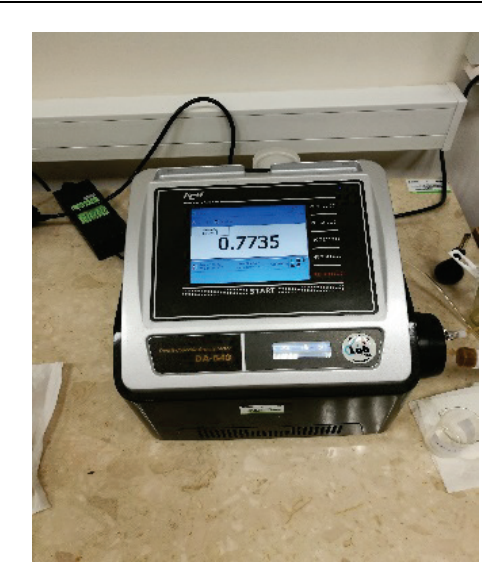
Fig. 5. DA-640 oscillatory density meter