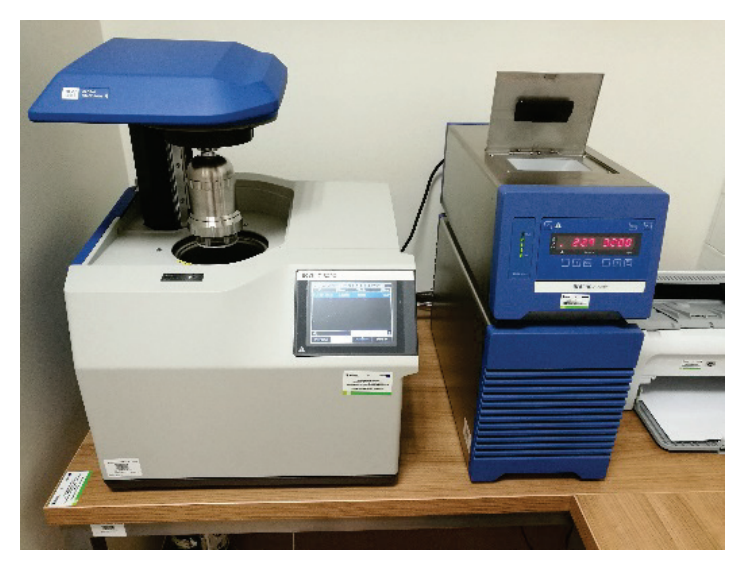
Fig. 4. IKA C 600 calorimeter