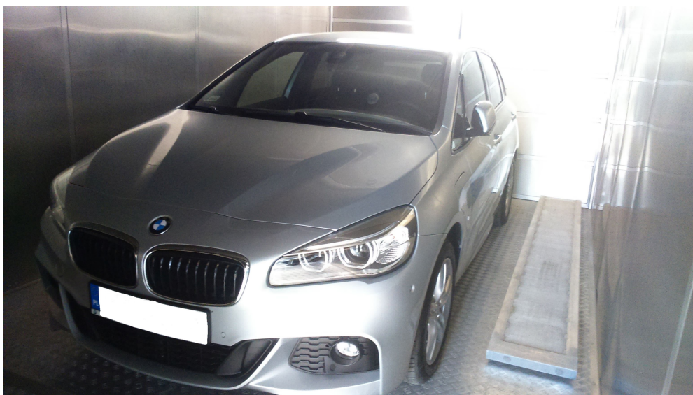
Fig. 1. BMW 225 XE inside the climatic chamber

The new, not used, passenger car, BMW 225 XE (C-segment) produced in February 2017 was tested (Fig. 1). That plug-in type hybrid achieves nominal power 224 horsepower. It consists of a combustion engine located in front and an electric motor on the rear axle. Both engines can operate depending on the situation and the state of charge of the high voltage battery, individually or together. When only the internal combustion engine is running, the front wheels are driven. In turn, the electric motor drives the rear wheels. According to the manufacturer's data, on the battery it can drive up to 41 km without any emission. In Tab. 1, technical data of the engines of tested car is presented. Among the main materials from which the interior of the vehicle was made were black perforated leather (seats and door panels), synthetic leather (central console) and plastics. Organics glues and paints were also used to finish the cabin.