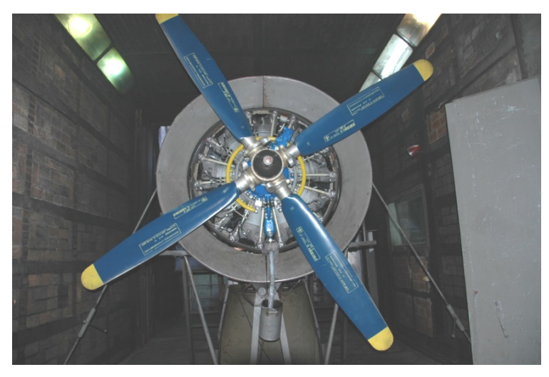
Fig. 1. ASz-62IR-16E Engine on test stand. Front view

The object of modernization was the ASz-62IR-16 engine (Fig. 1). This unit is a product of a Polish company supplying it to customers in Eastern Europe, South America, and Canada, with good prospect to enter the Chinese market. The engine is used in small and medium-sized cargo (Antonov AN-2) and agricultural (M18 Dromader) aircrafts. The engine is an air-cooled, four-stroke gasoline unit of 9 cylinders in radial setup, mechanically charged by a radial compressor powered by an engine crankshaft. Total engine cubic capacity is 29.87 dm<sup>3</sup>, and the compression ratio is 6.4:1. The maximum take-off power is 1000 HP at 2200 rpm. The maximum fuel consumption is 300 kg/h.