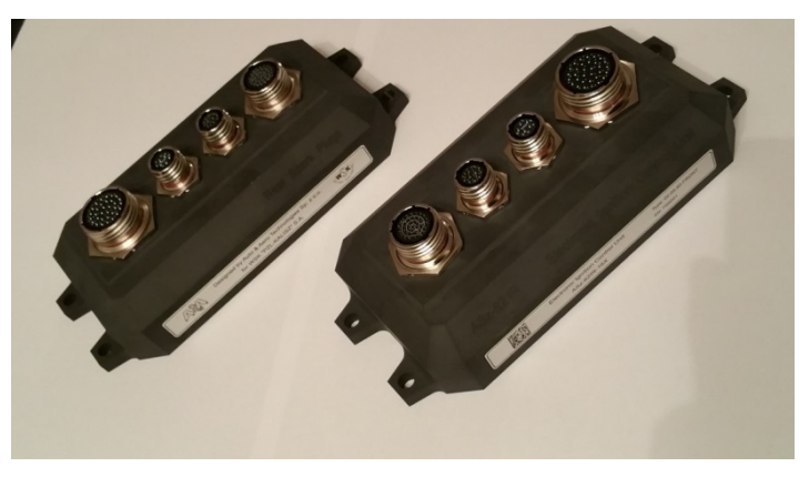
Fig. 4. Original design of ignition system control units

This was especially important in the case of the design of control unit casing: custom-made, airtight, made of anodized aluminum and equipped with MIL-38999 type hermetic connectors of nickel alloy (Fig. 4).