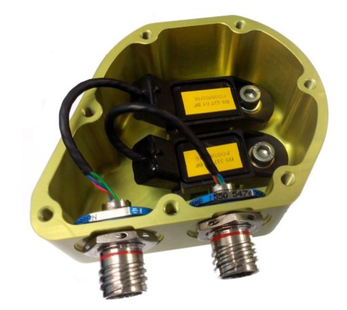
Fig. 5. Air pressure sensors in custom-made protective casing

If it is necessary to use components that do not conform to a particular requirement themselves, they should be assembled in a way that guarantees that the requirement is met. This possibility was used, among others, in the case of air pressure sensors: the sensors' original body was made of plastic and did not fulfil fire resistance requirements. Therefore, the sensors were put inside a custom-made aluminum casing (Fig. 5), and this method of protection fully satisfied the considered requirement.