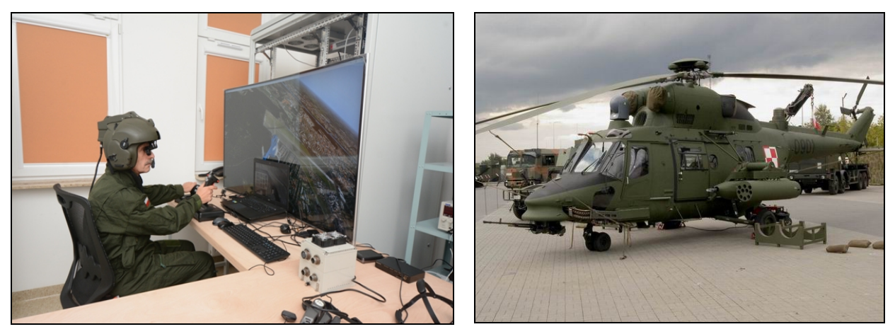
Fig. 3. The NSC-1 Helmet-Mounted Cueing System for W-3PL military helicopters [11]

The NSC-1 ORION is the first polish helmet-mounted cueing system (Fig. 3.) developed in the AFIT's Department for Avionics and dedicated especially for W-3PL GŁUSZEC and Mi-24 helicopters (for the version equipped with the Integrated Avionics System). The NSC-1 system designed for W-3PL is capable of providing helmet controlled target cueing of the turret gun 12,7 mm WKB-M and other helicopter's guided weapon systems, displaying pilotage-navigational and aiming information during day and night flights (using NVG) at the same time. The NSC-1 system can realize the above-mentioned functions independently or in cooperation with an optoelectronic surveillance system (e.g. TOPLITE system).