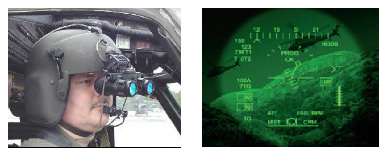
Fig. 1. The ANVIS Helmet-Mounted Display System for AH-1 military helicopters [8]

Among numerous methods used to present flight parameters, there are used indirect methods using head-up displays motionless in relation to the cabin (e.g. HUD-type) and direct methods, in which helmet-mounted displays (ocular or video) are permanently connected with the pilot or operator's helmet [8]. In addition, on the helmet's ocular or viewfinder there are displayed vital information about, among others, flight velocity, altitude, and rate of climb as well as cueing data for all weapons. The display also shows information needed in an emergency.