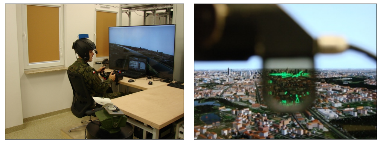
Fig. 4. Demonstration Station for new functions testing of Helmet-Mounted Display Systems [11]

with a mounted, integrated avionics system. Fitted with a moving fire position (with the option of helmet-mounted control) and an observation-cueing system with a TOPLITE head, which enables the detection and identification of a survivor at large distances with the use of an integrated comsystem and a RSC-125G on-board radio direction finder.