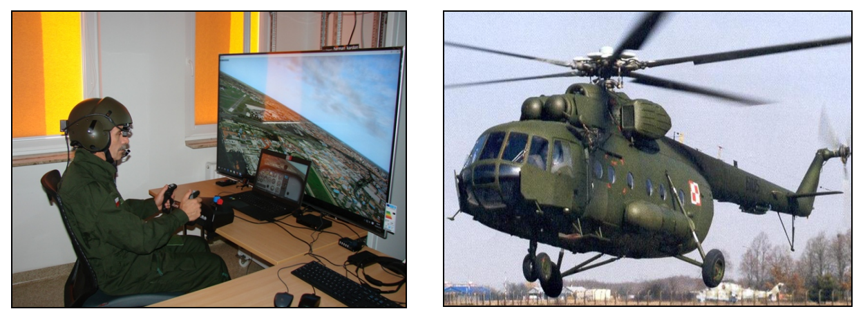
Fig. 2. The SWPL-1 Helmet-Mounted Display System for Mi-17-1V military helicopters [11]

The SWPL-1 system in the version for the Mi-17-1V helicopter performs imaging of 16 flight parameters in three variants of sets (chosen by each of the pilot independently) and includes 28 emergency states in the warning (WARN) and error signalling (FAIL) system. Prior to each flight, the system performs automatic diagnosis of the technical condition of the system's basic modules, with the ability to add corrective and navigation data [1].