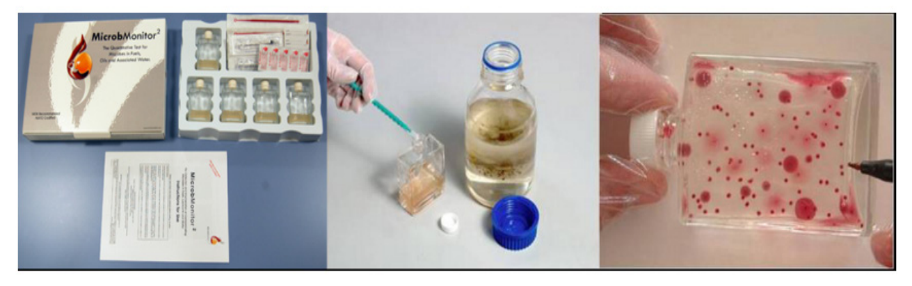
Fig. 4. Detection of microorganisms using a special kit MicrobMonitor [12]

Simplified, but much faster and less expensive way to determine the amount of microorganisms in the fuel are commercially available special kits, which finished substrate suitable for growth of microorganisms, which are applied to fuel sample (e.g. MicrobMonitor2). The advantage of this solution is the simplicity of use test that can be performed by a person not familiar with laboratory practice [7].