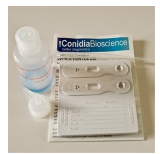
Fig. 5. Kit FUELSTAT<sup>TM</sup> do to study the of microorganisms with an indication of the remedies [14]