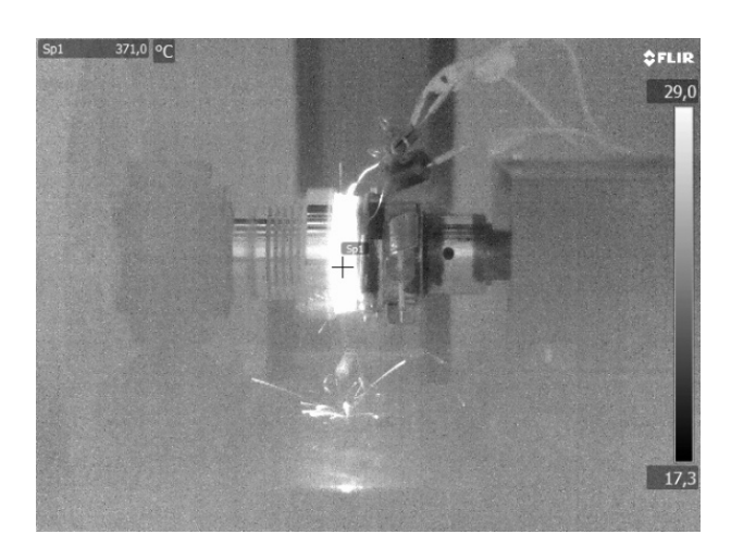
Fig. 5. Thermographic camera position during tests