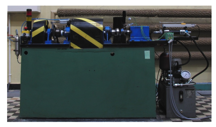
Fig. 3. IL-68 test stand side view

Methodology of the full-scale tests is similar [6] but much larger inertial type test stands are used and test campaign consists of 10 bed-ins and up to 100 qualification brakings of tested brake (equipped with wheel and sometimes with other parts of the landing gear or suspension). Example of technical parameters of M3T full-scale inertial type test stand used in Landing Gear Laboratory is shown in Tab. 1 and example of test set-up is shown in Fig. 4.