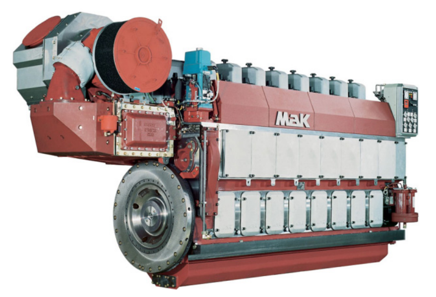
Fig. 1. View engine type M20C Company MAK [10]