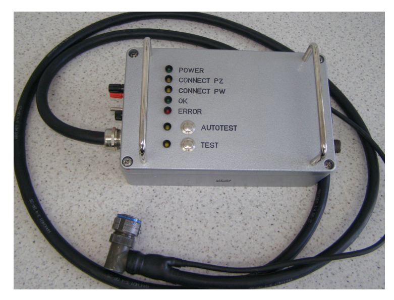
Fig. 2. The UT-04 testing device