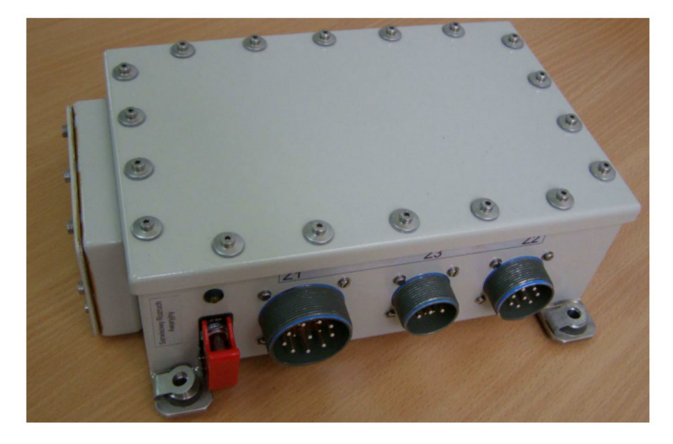
Fig. 8. MUR-2 Microprocessor starting device

The MUR-2 device works with a starting system of the vehicles T-72, PT-91. WZT-3 and replaces the previously used 4 electronic blocks: PAS 15-2S, PUS15R, BSP-1M and SP-R.