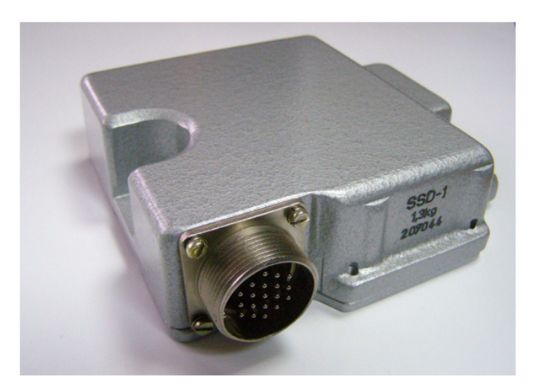
Fig. 9. Indication box SSD-1

The SSD-1 box is electrically and mechanically interchangeable with KDS1-1S and KDS1-2S blocks. It is designed for controlling dimensional lights of the vehicle, signalling turning, braking and pulling up.