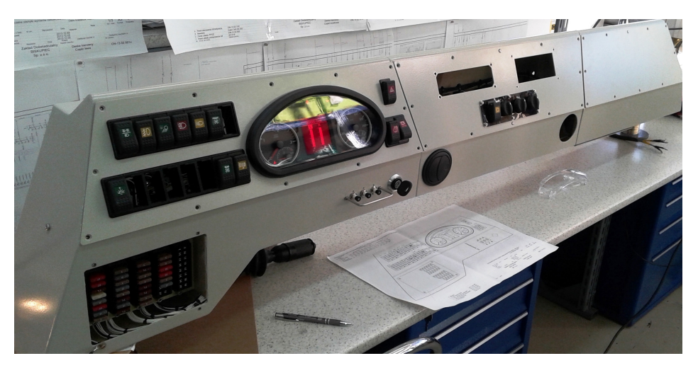
Fig. 4. The ON-13 Driver's Dashboard

according to J1939 standard, significantly reduced the number of electrical connections between the ON-13 dashboard indicators and engine and gearbox controllers, increasing at the same time the reliability and scalability of the system.