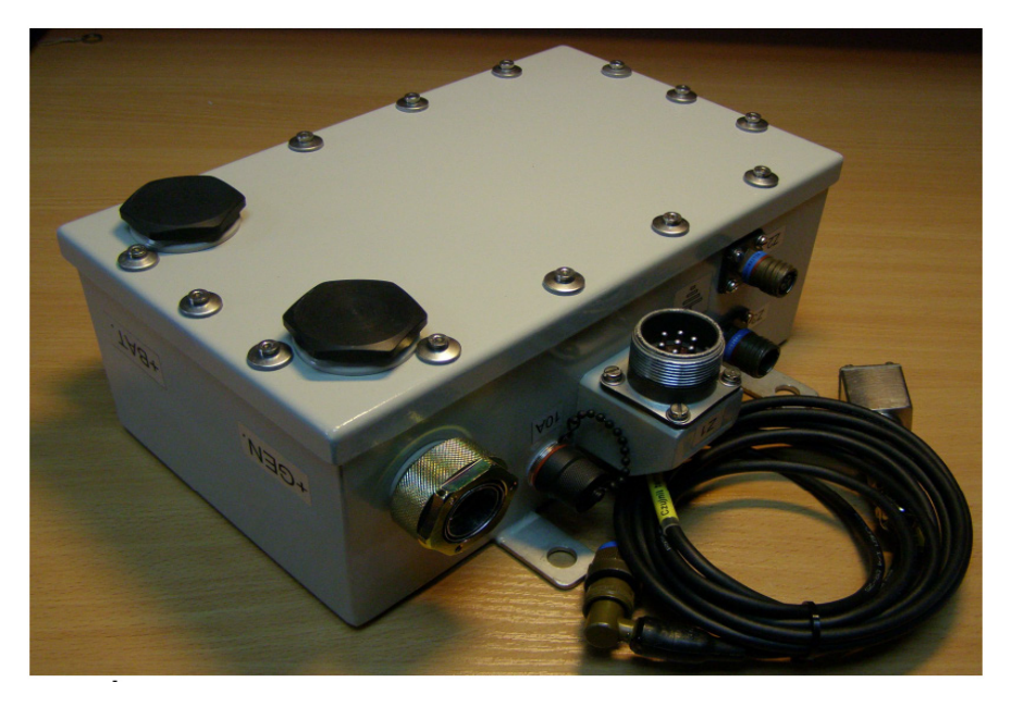
Fig. 7. Voltage Regulator RN-10U2

The regulator has been designed and manufactured in accordance with EMC Requirements.