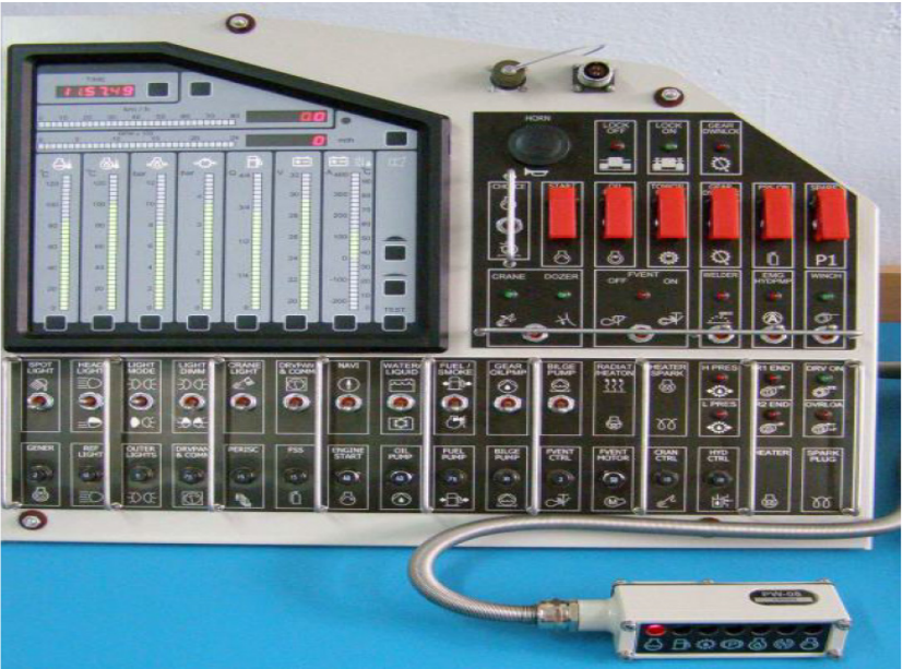
Fig. 3. The PK-08 Control Panel with the PW-08 version up to the WZT-3

Switches and fuses used come from well-known global manufacturers and they meet military standards.