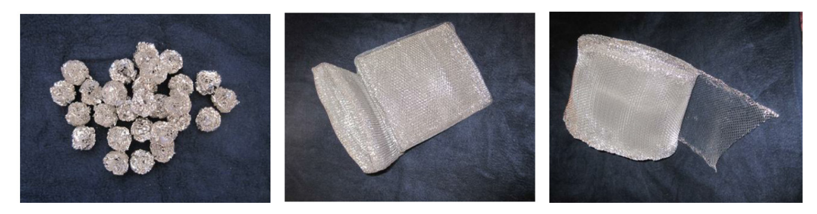
Fig. 13. Elements used to fill tanks to protect against explosion

An important factor is also the explosion protection and the protection of the entire system against the fire.