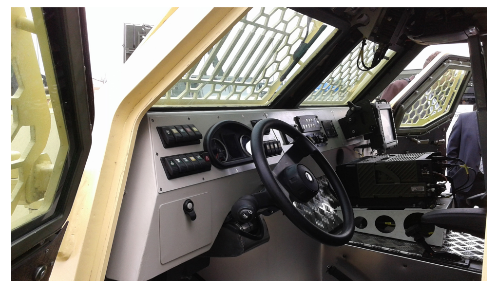
Fig. 5. The ON-13 Dashboard mounted in the vehicle