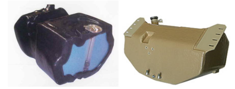
Fig. 12. Examples of tanks with ballistic protection

An important factor is also the explosion protection and the protection of the entire system against the fire.