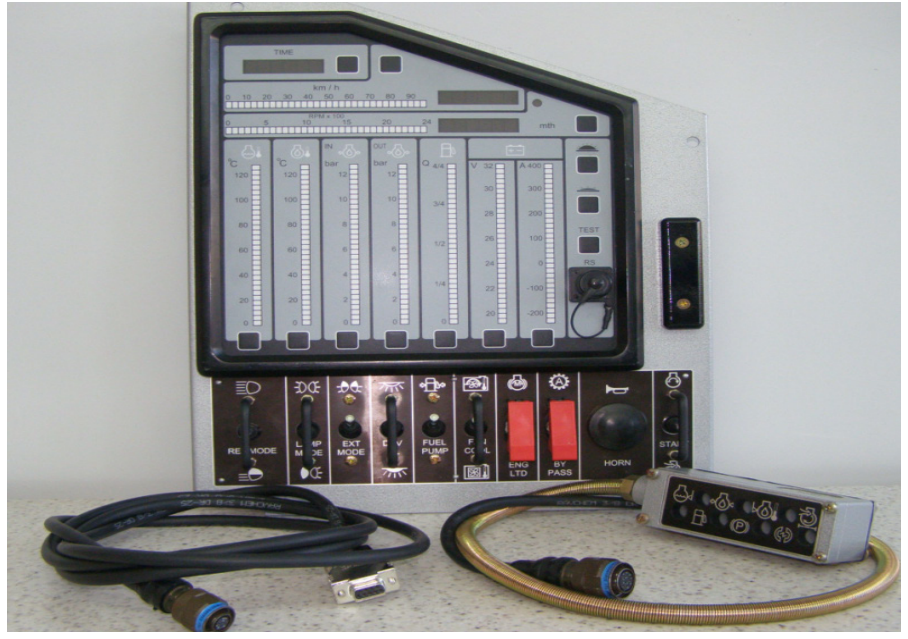
Fig. 1. The PK-04 Control panel

The indication accuracy of these devices far differed from the requirements set out by the PT-91M tank's contractor; what is more, the driver's board in the original form did not meet any of the modern requirements of electromagnetic compatibility (EMC). In 2004 after making arrangements with the manufacturer of the tank the PK-04 driver's control panel was proposed – Fig. 1. The control panel is dedicated to all vehicles using the T-72 chassis or constructed because of this vehicle.