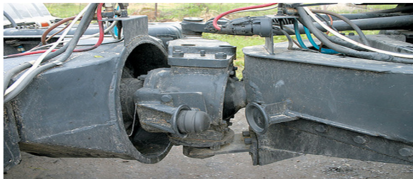
Fig. 2. A rotary-adhesion device of the hinge-joined chassis of “Babymammoth”

What is the purpose of using this complicated unit? Firstly, as it was mentioned previously [8, 9, 10, 12], while producing VELPT, the units which are part of batch-produced vehicles of off-road capability and also tractors, are used. “Babymammoth” is not an exception, the units of motorcar GAZ-66 (later its successor GAZ-3308 “Sadko”) are used in its transmission, elements of suspension and frame. “Babymammoth” provides better cohesion with bearing ground.