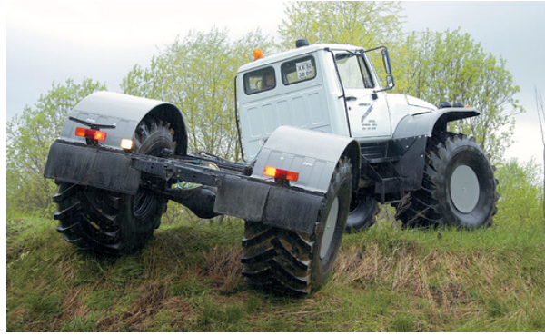
Fig. 1. VELPT for goods delivery “Babymammoth”