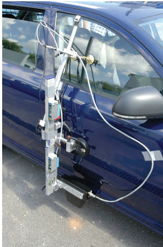
Fig. 3. Optical head mounted to vehicle