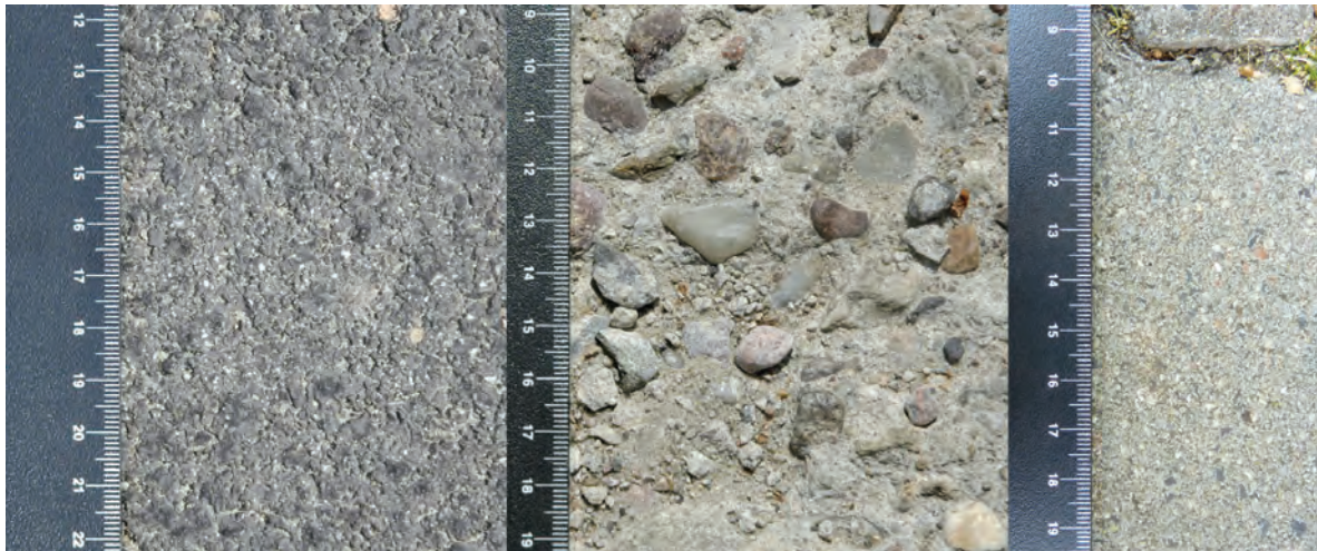
Fig. 1. Road surfaces (starting from left) good quality smooth asphalt, poor quality concrete road surface, pavement of Bauma bricks

The road surface design and its condition influencing the distance measurements was analyzed (and indirectly influencing speed measurements also) measured with optical head. Two road surfaces extremely different were selected for the tests: good quality asphalt with a small texture depth and poor quality concrete surface with visible stones and rather high texture depth parameter and additionally road surface with paving BAUMA blocks widely used in residential areas (Fig. 1).