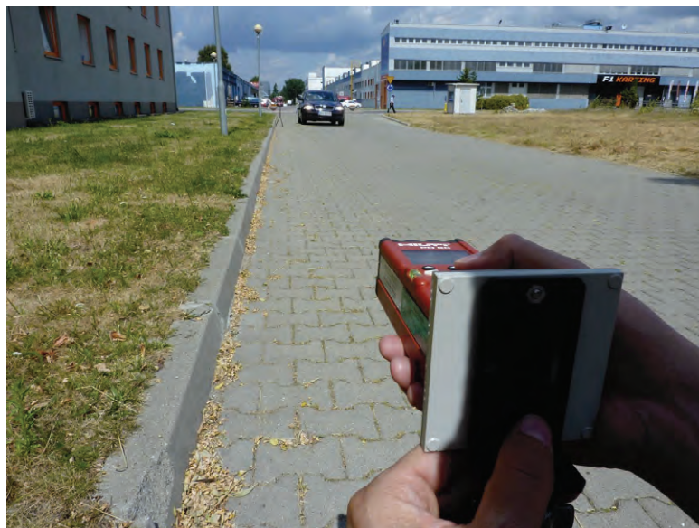
Fig. 2. Measurement of standard distance between photo barriers

On the measurement track two photo barriers with retroreflective elements were placed. The signals from the photo cells were reflected from the retroreflective barriers giving starting and stopping triggers. The distance between barriers was precisely measured with the laser distance meter (Fig. 2).