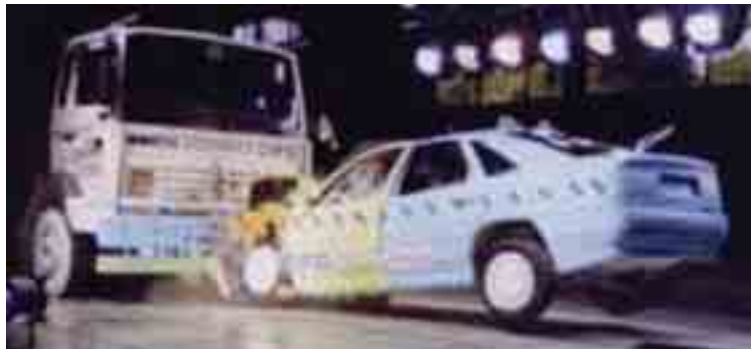
Fig. 5. Front under run crash test – INRETS