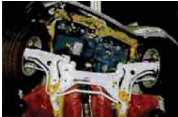
Fig. 7. Vehicle underbody after frontal impact against OBD – BASf