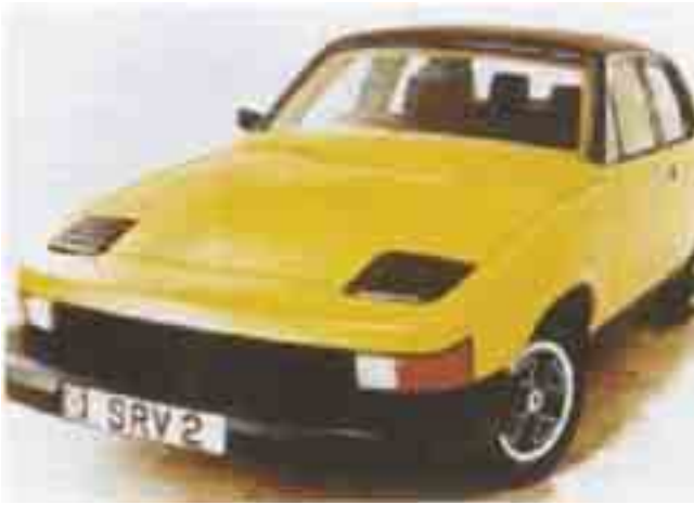
Fig. 1. The early version of Experimental Safety Vehicle – TRL