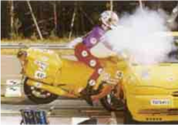
Fig. 3. Motorcycle equipped with airbag and leg protectors crash test – IMMA