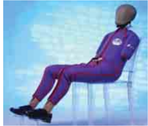
Fig. 4. Test dummy WorldSID – the 5 percentile woman – INRETS