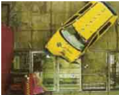
Fig. 6. Frontal impact against OBD – TNO