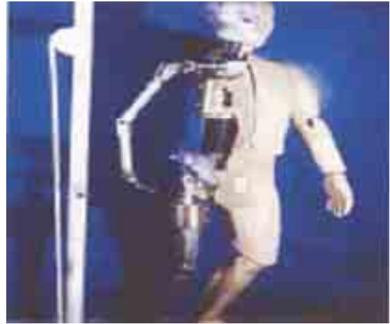
Fig. 2. The early anthropometric research dummy – INRETS