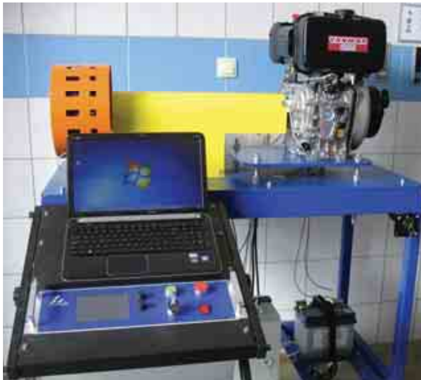
Fig. 3. View of stand

Introducing CAN network communication in the brake control system between the control module and measurement module of the test bed enables not only registering current parameters on-line, but also remote controlling the changes in the parameters.