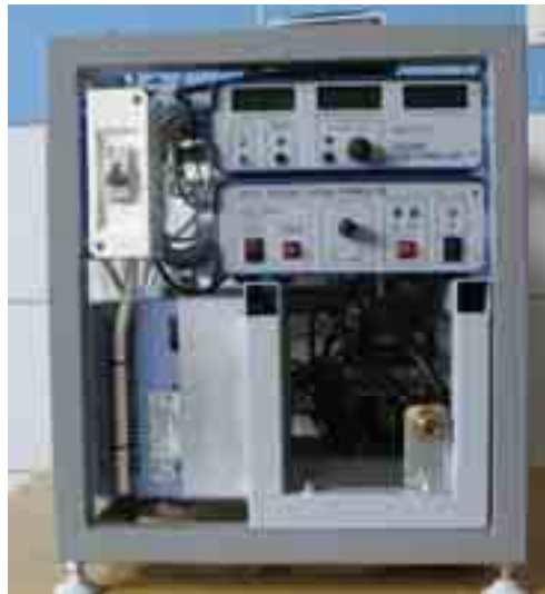
Fig. 4. View of CR supply module

The applied regulator of the high pressure pump controlling and the pressure regulator in the accumulator facilitate external controlling of the performance parameters of the system, thanks to which it is possible to smoothly control the pressure of the fuel in the accumulator.