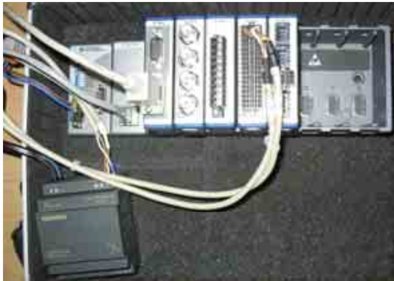
Fig. 6. View of central control module