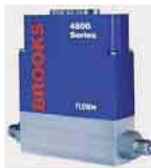
Fig. 5. Brooks 4850 regulator of gas mass flow

The system delivering gaseous fuel to the suction manifold of the analyzed engine comprises bottles with every component of biogas, reducers and Brooks 4850 regulators of gas mass flow. The possibility to control the engine applying RS232 communication standard allows the researchers to obtain a mixture of gases of complex chemical composition, which is then delivered to the suction manifold. Such a solution makes it possible to conduct the experiment knowing that the composition of the gaseous mixture will vary, and thus to determine the influence of particular biogas elements on the performance parameters of the analyzed engine.