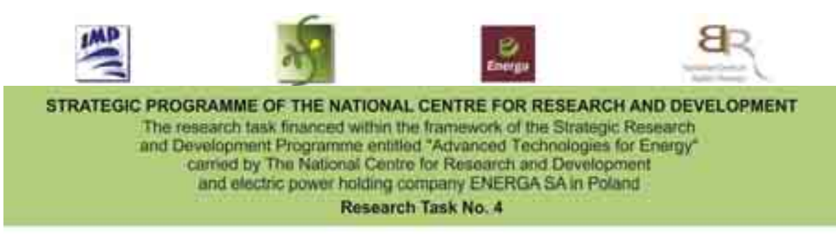
DEVELOPMENT OF INTEGRATED TECHNOLOGY OF FUELS AND ENERGY FROM BIOMASS, AGRICULTURAL WASTE AND OTHER