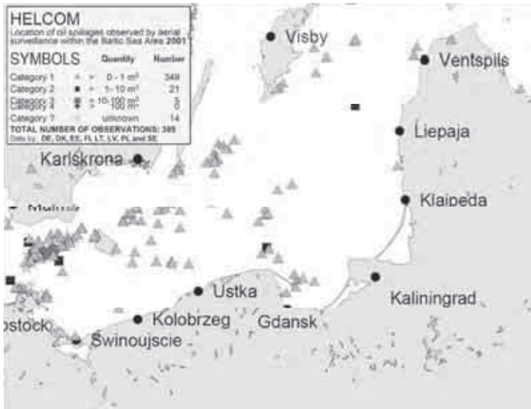
Fig. 2. Aerial detections of oil during air surveillance in one year in the Southern Baltic – example. Processed after HELCOM portal ( www.helcom.fi )