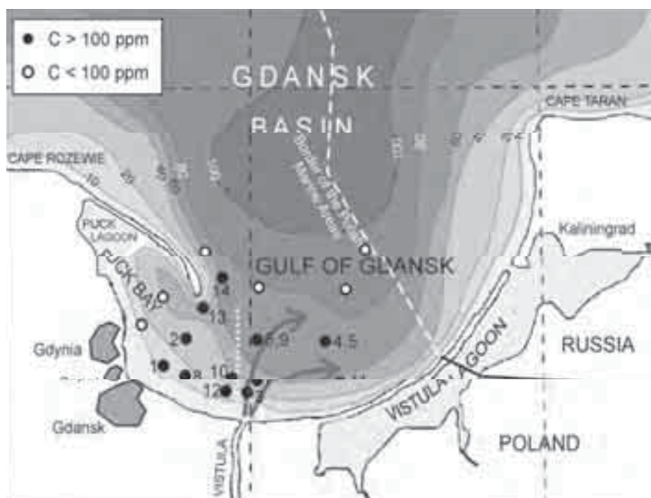
Fig. 3. Map of investigated area in the Gulf of Gdansk with points of water sampling. Dotted white line indicates offset yield of Vistula River disturbance area, narrows – the most probable direction of spread of the Vistula waters

Entire tested basin could be divided for two parts: the area, where the Vistula impact occurs, that is east of the river mouth, and the area west of the mouth, where does not direct impact of the river. It was assumed that contamination might have flow down the Vistula River if a point is to the east of the meridian of 18°55' (dotted white line in Fig. 3). Average concentration of oil in the water is estimated as 5.0 \cdot 10^{-8} in the east-area and that is more than in the west-area, where the mean concentration is 3.8 \cdot 10^{-8} . This fact confirms petroleum runoff the land based sources with the river water. It is important here that eight of the fourteen highest concentrations refer to the places west of the boundary meridian.