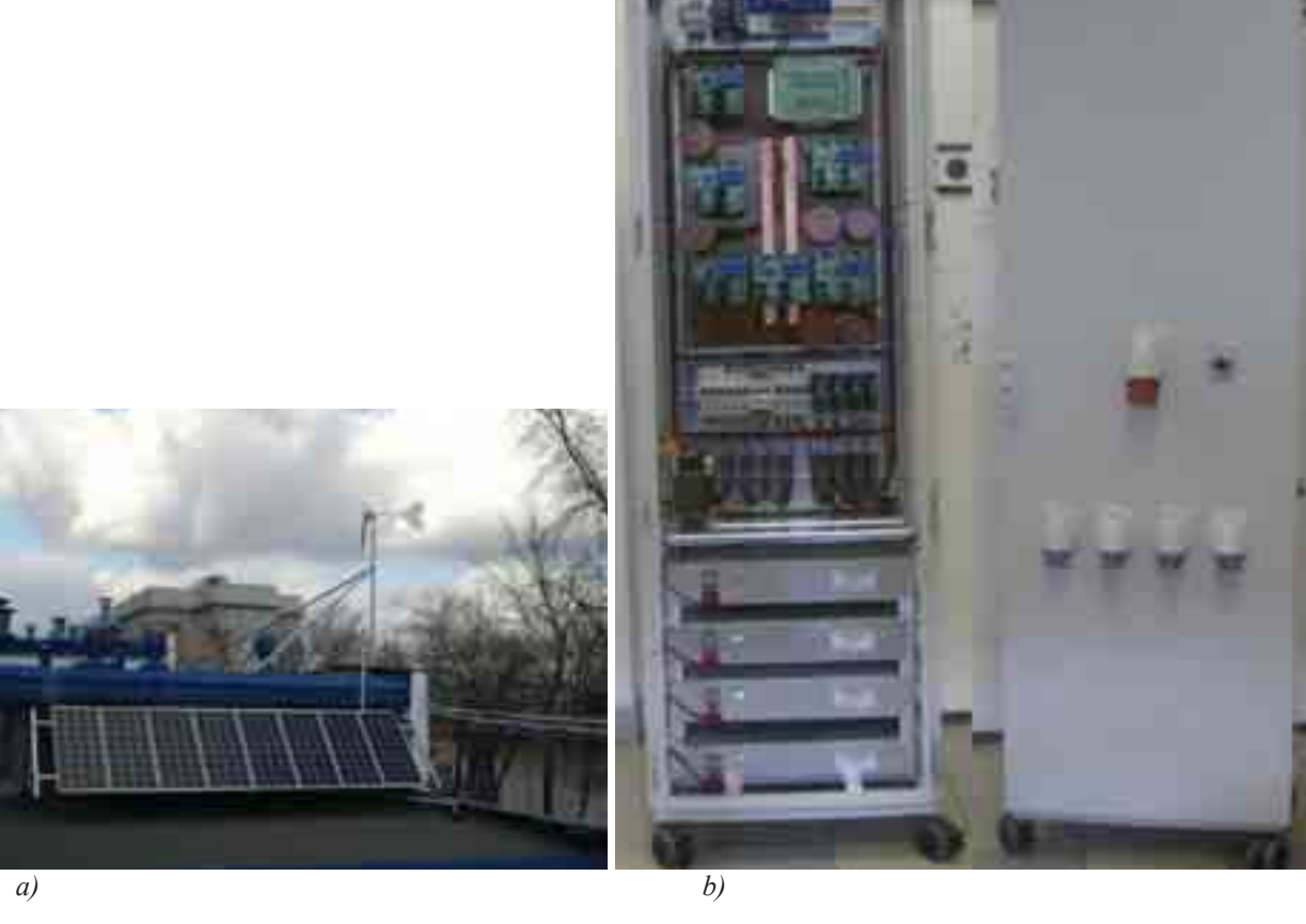
Fig. 2. View of photovoltaic panels (a) and control cubicle (b) of the charging station demonstrator