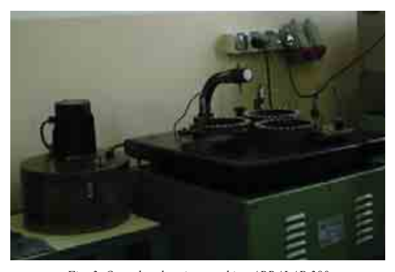
Fig. 3. One-plate lapping machine ABRALAP 380

To find emissivity of the lapping plate, next to the camera, a contact thermometer TES1312 Dual K-Type was used. The experiments were carried out on a plate-lapping machine ABRALAP 380 with a grooved cast-iron lapping plate and three conditioning rings (Fig. 3). The machine kinematics allows for direct adjusting wheel velocity in range up to 64 rpm. It is also equipped with a four-channel tachometer built with optical reflectance sensors SCOO-1002P, and a programmable tachometer 7760 Trumeter Company, which enables to read the value of rings and plate rotational speed.