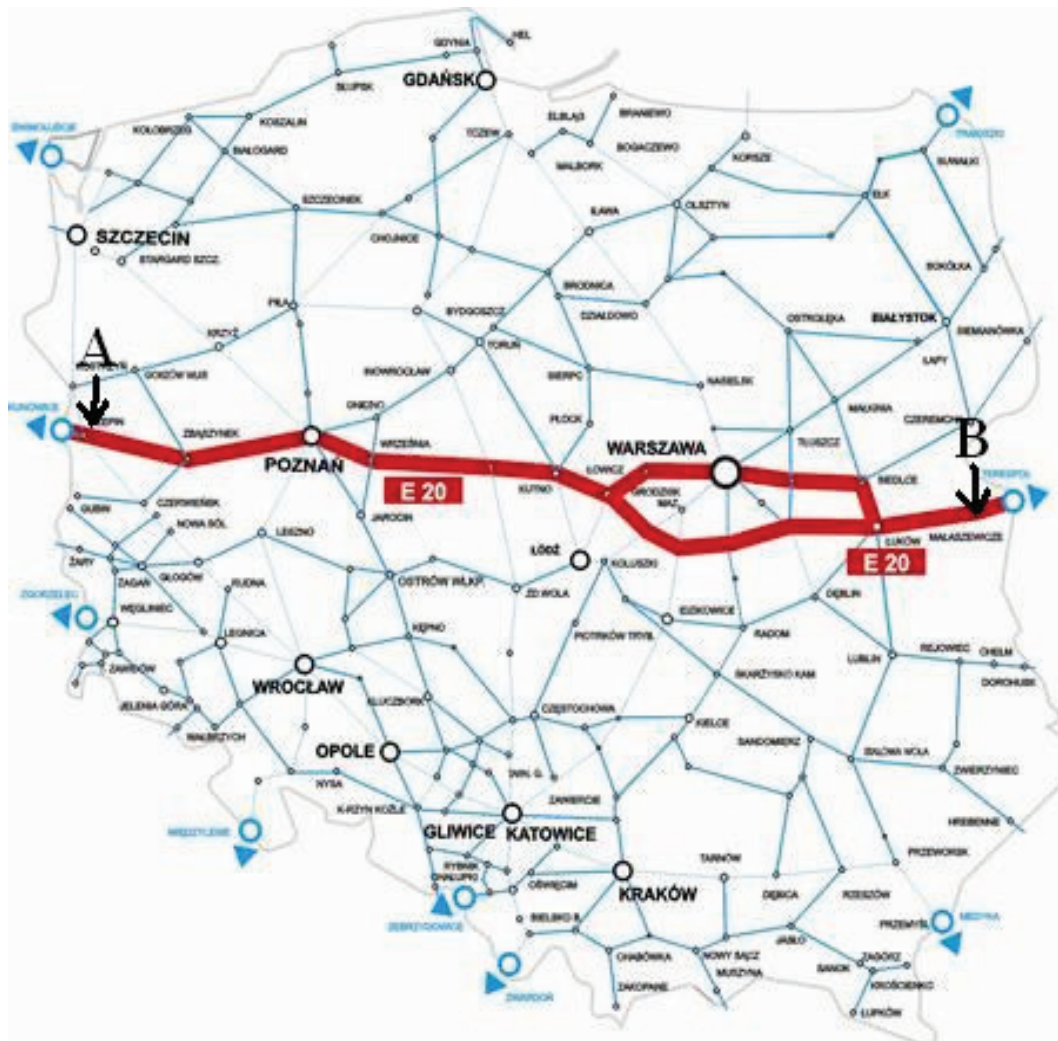
Fig. 1. The railway route from Rzepin A –Małaszewicze B

The course of railway router from Rzepin to Małaszewicze has been presented in the Fig. 1: