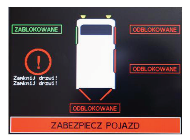
Fig. 3 Touch panel steering the cash transport vehicle

Computer interface locking and unlocking the door was made using the LCD touch screen with size of 118x90 mm (Fig. 3). The screen is installed in the immediate vicinity of the dashboard taking into account quick and intuitive access to functions