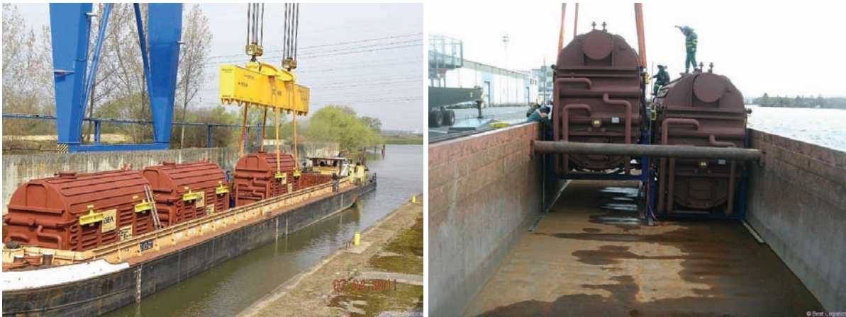
Fig. 5. Transport of oversize elements, operated by Best-Logistic Sp. z o.o. [5]

In inland shipping an oversize cargo is one that protrudes beyond the vessel's length or/and width or which reaches up above the highest fixed element of the vessel (vertical clearance of bridges, lock gates etc.), so that the helmsman has restricted vision (Fig. 5).