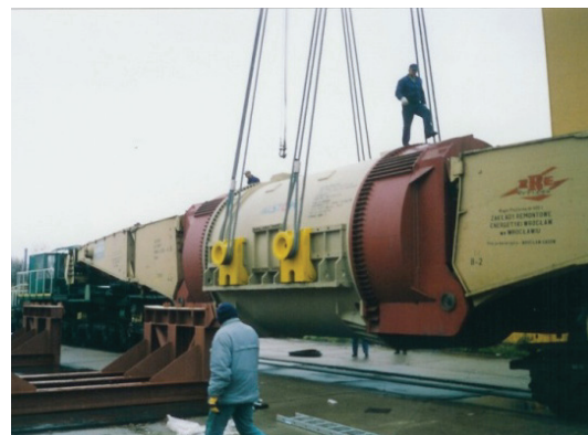
Fig.4. Unloading of 330 ton generator from a NORCA wagon by the Metalchem Serwis Ltd [8]