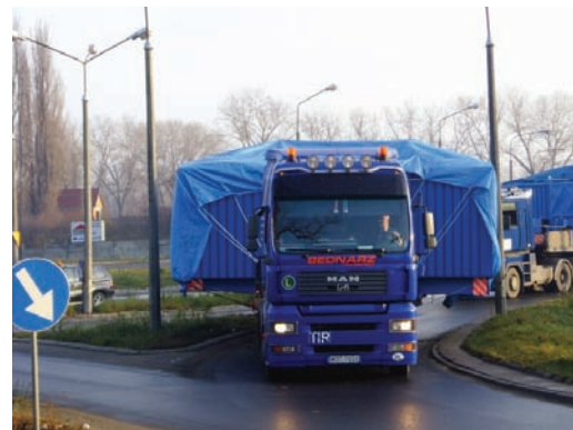
Fig. 2. Transport of wide oversize cargo [12]