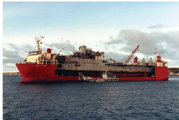
Fig.7. Transport of a frigate USS Samuel B. Roberts [4]

Taking all above into account, it seems that the most adequate definition for all modes of transport can be formulated as follows: