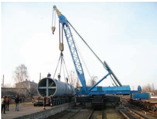
Fig. 1. Unloading of a tank [12]

For each mode of transport oversize cargoes are those with parameters larger than standard ones. This issue is due to the existing restrictions of both vehicle design parameters and the transport infrastructure. For instance, one will not load a larger piece of cargo into an airplane than its hold, as it simply will not get in, and one cannot load a 600-ton of goods onto a barge with a 500-ton capacity because, even if the barge bottom has strength enough to withstand compression forces and the cargo is ideally distributed, the vessel will sink. Similarly, a truck with carrying 4-metre high object will not pass under a bridge having a 3.8 meter clearance. It can be stated that in all the above cases the oversize determinants are either cargo dimensions or weight, as well as available cargo space inside a vehicle and pressure exerted on a unit surface area. The shape of a cargo piece is another important factor, as the geometry of an object carried may affect static and dynamic stability. In road transport it is said that cargo is oversize when its dimensions or weight exceed the maximum allowable parameters of a standard road vehicle or vehicle with a trailer as well as axle loads of this vehicle (Fig. 1 and 2).