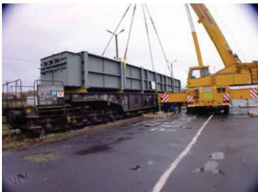
Fig. 3. Transport of equipment modules for the refinery industry by C.Hartwig – Katowice S.A. [7]