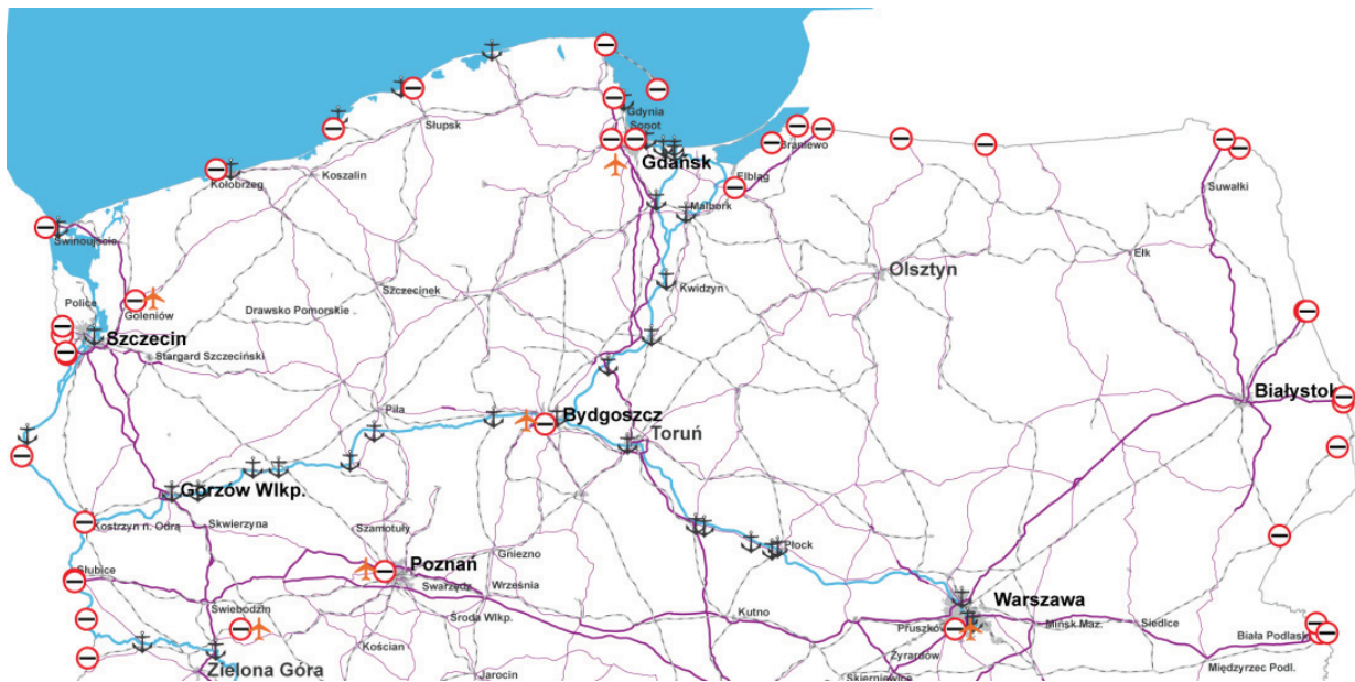
Fig. 9. Transport infrastructure adjusted to OC transport

The process of determining transport corridors began from collecting the maps with the existing roads, rail tracks and inland waterways that are adjusted to accommodate oversize transport, then the point infrastructure was mapped, e.g. sea and inland ports that may become major reloading sites for OC carriage. Then the maps were supplemented with infrastructure to be built or modernized till 2020 and which will be adequate for OC transport (Fig. 9). The next stage was the mapping of potential points of sending and reception of oversize cargo [2].