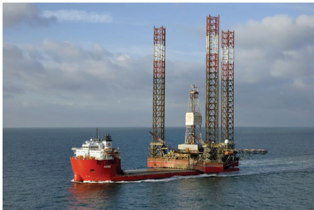
Fig.6. Transport of a drilling rig [9]

In sea transport oversize cargo items are sometimes a few hundred metres in length, weighing from a few hundred to several thousand tons. Therefore, they are carried by dedicated ships. Examples include drilling rigs, cranes, ships, yachts, turbines etc. (Fig. 6 and 7).