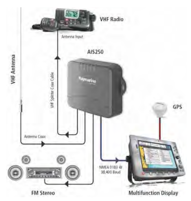
Fig. 2. AIS configuration [2]