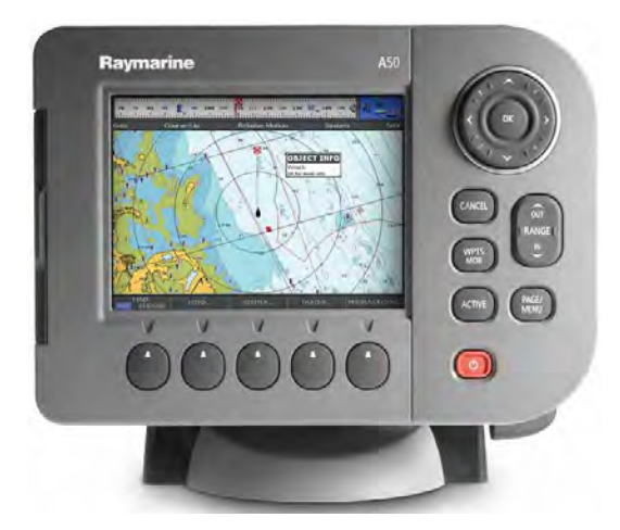
Fig. 4. AIS manufactured by Raymarine [2]

The fact that AIS is not used surprises because of its practicability fitting vessels with this device is made compulsory by the Convention. What is more, if the reason why the AIS indications are not reliable was explained, then it would be easy to get rid of it.