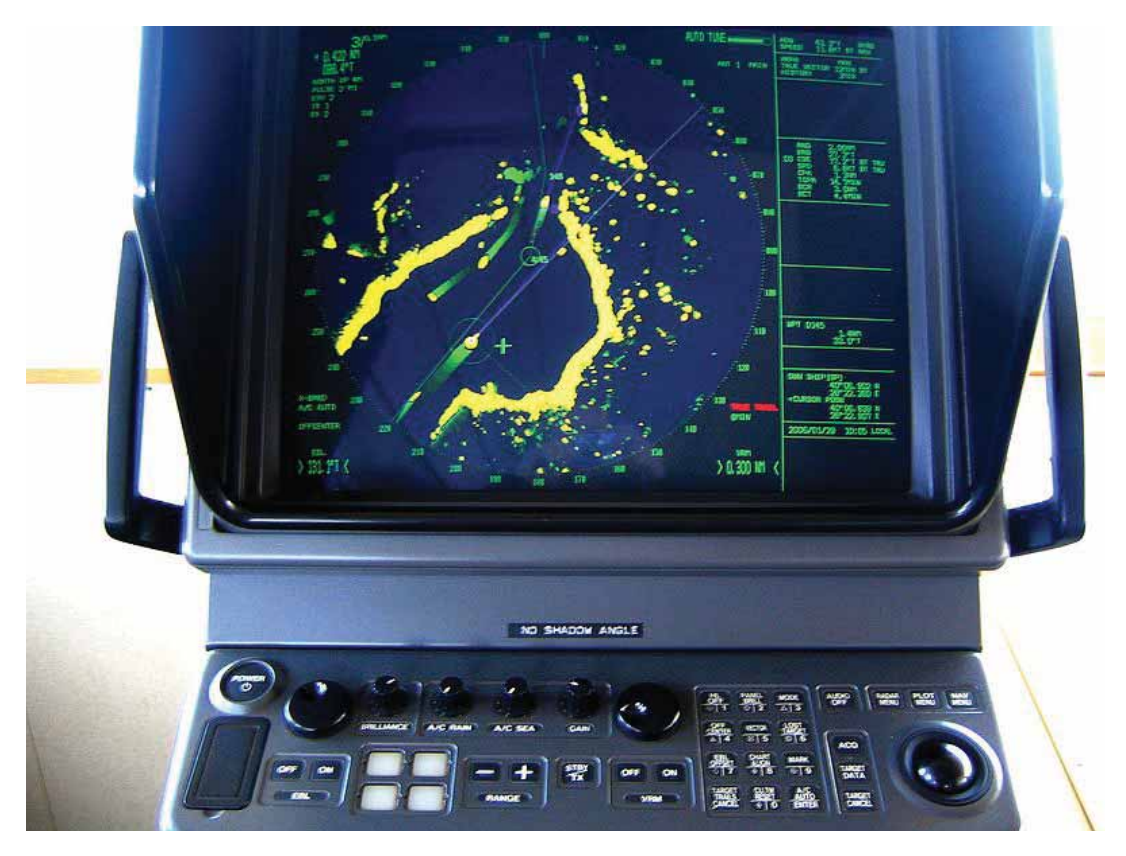
Fig. 1. ARPA screen

While at sea the navigator finds it difficult to say whether the ARPA indications are correct or not as it requires a lot of experience, proper skills and appropriate conditions, e.g. the observed vessel is on parallel course.